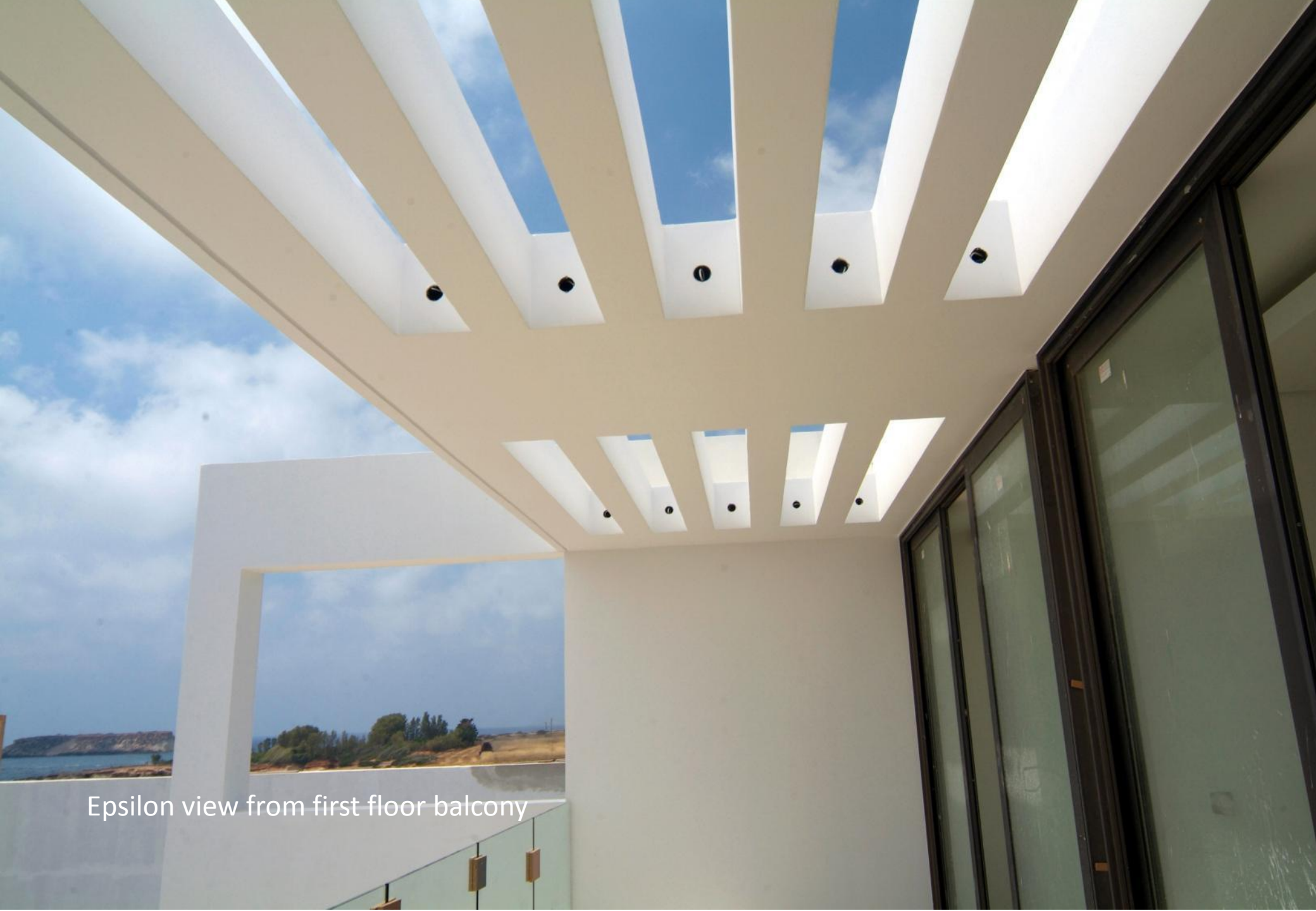
Epsilon view from first floor balcony