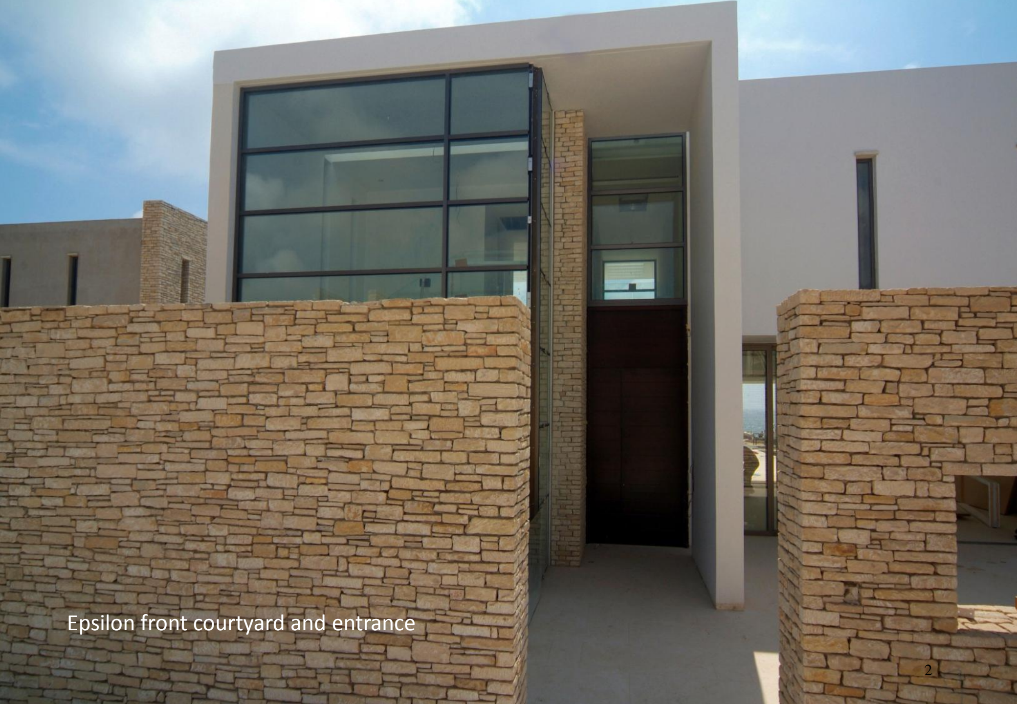
Epsilon front courtyard and entrance