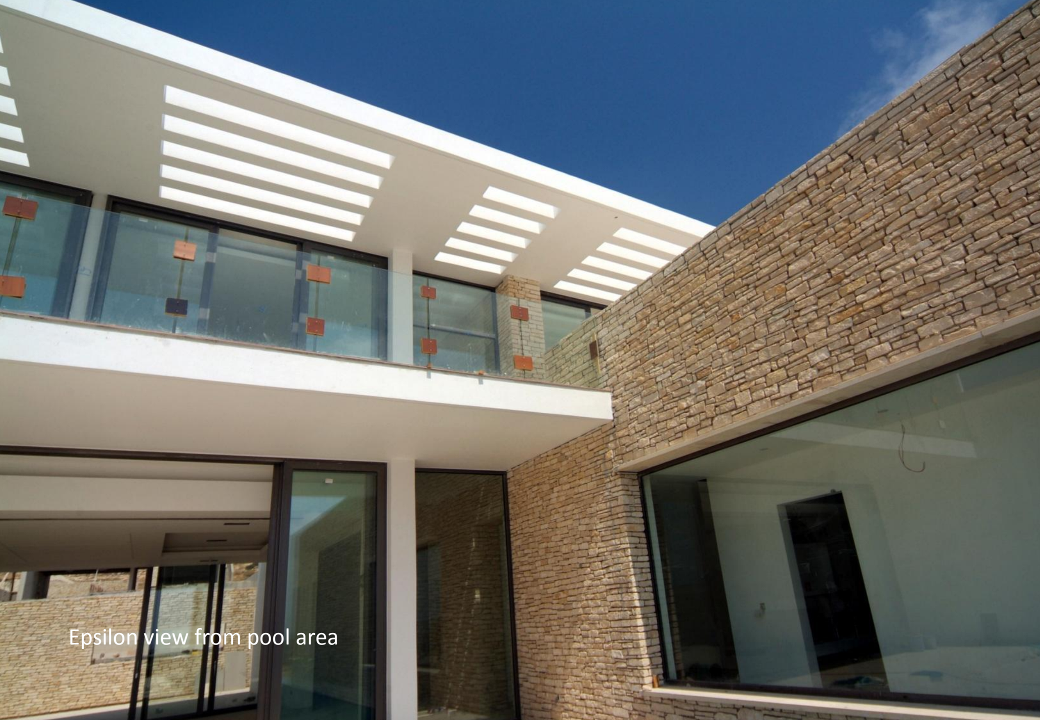
Epsilon view from pool area