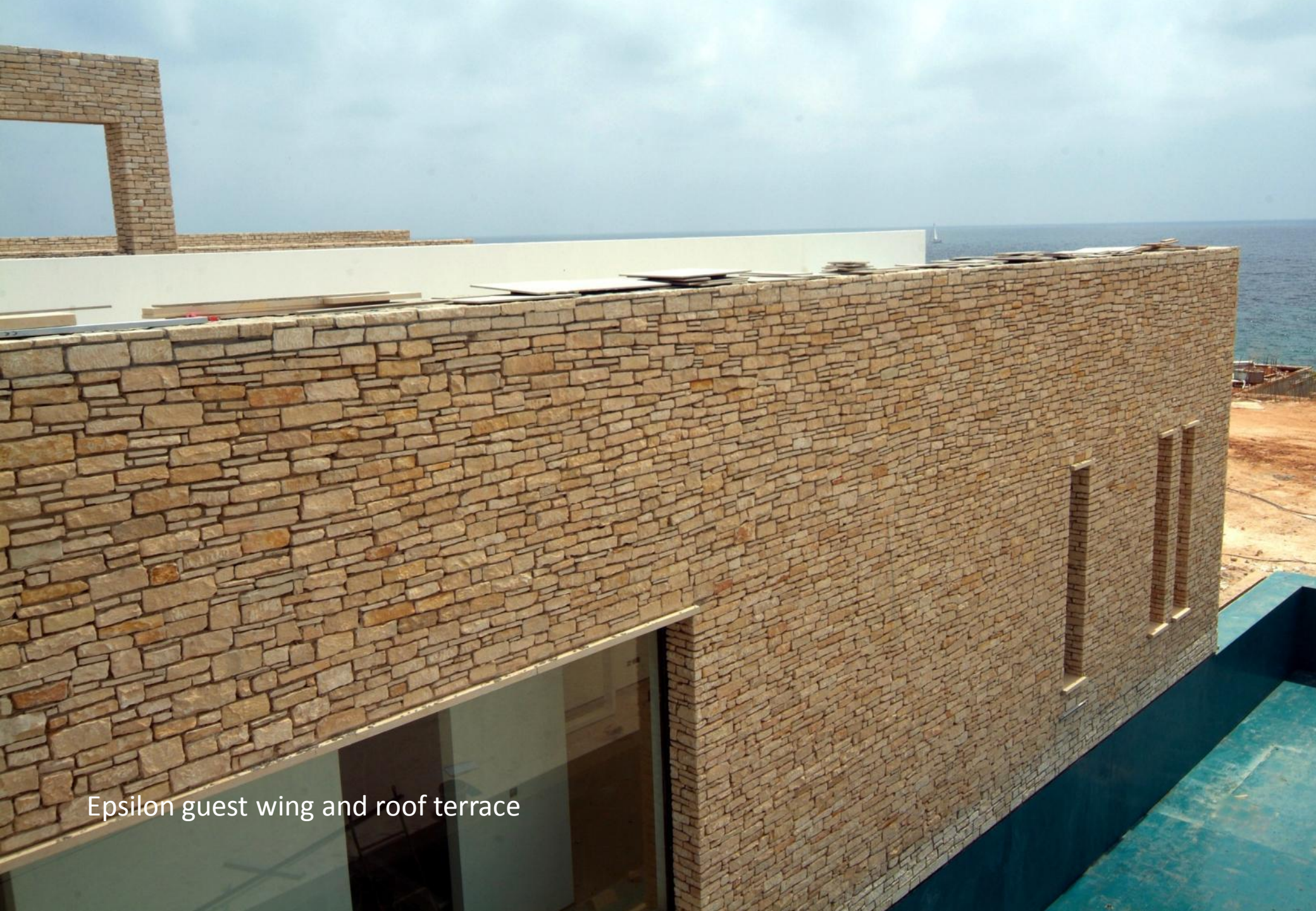
Epsilon guest wing and roof terrace