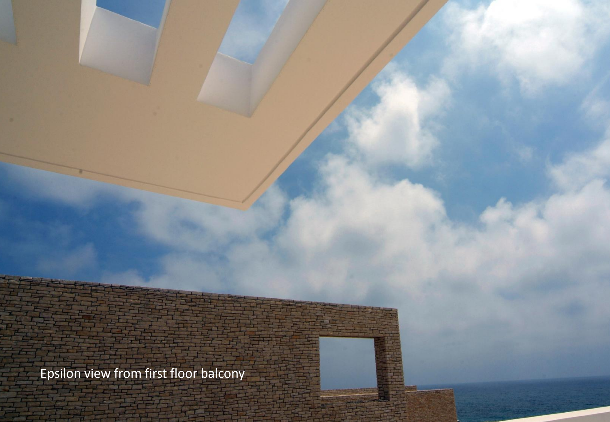
Epsilon view from first floor balcony