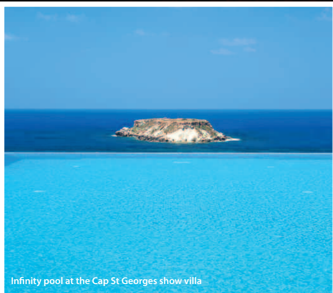
Infinity pool at the Cap St Georges show villa