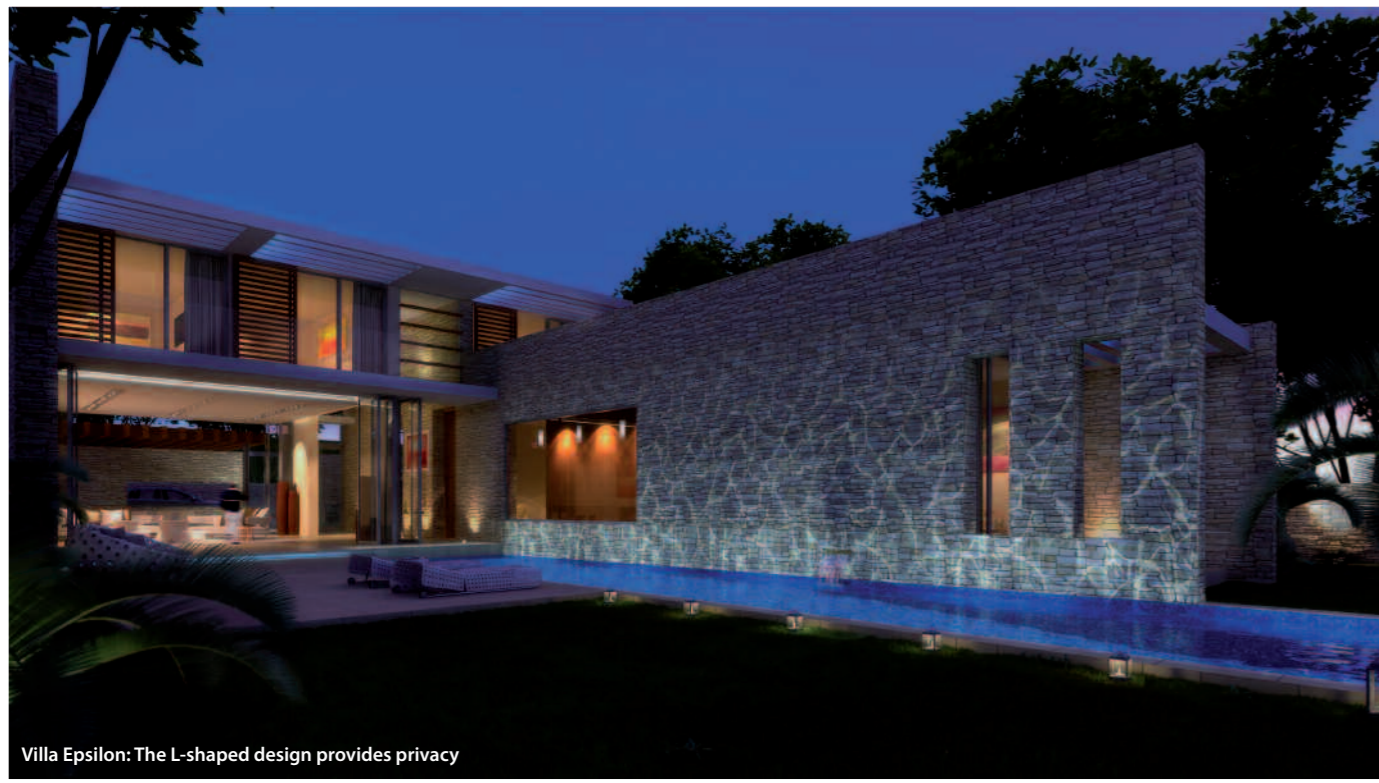
Villa Epsilon: The L-shaped design provides privacy