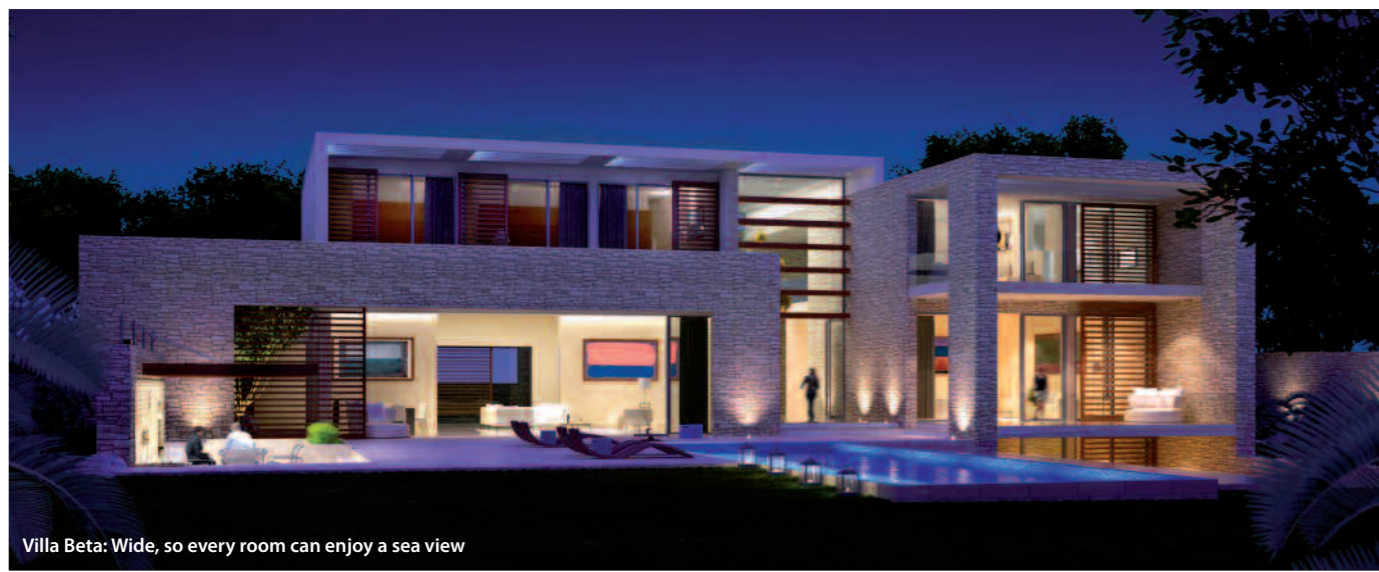
Villa Beta: Wide, so every room can enjoy a sea view